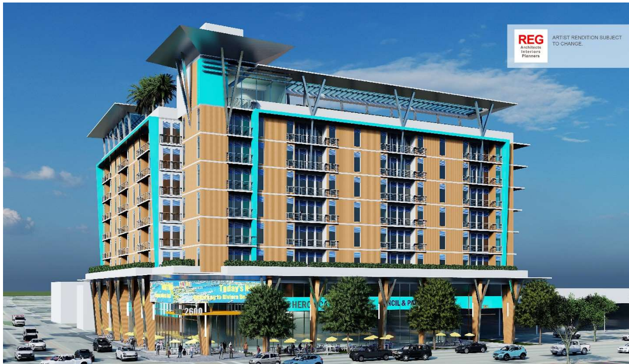
Figure – 2600 Broadway Concept Use Rendering.

The concept for redevelopment is shown below: