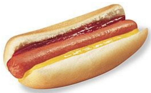
1 Hot Dog per child