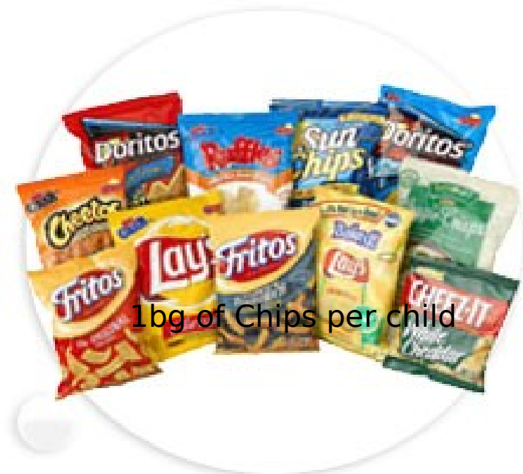
1bg of Chips per child