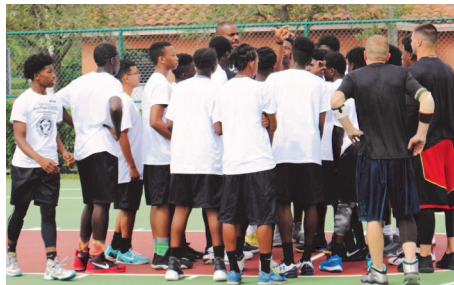
Jayson Williams talking with Camp teenagers

The Jayson Williams and Charles Oakley Basketball Camp was held on Saturday, March 18, 2017, at Dan Calloway-Tate Recreation Center. What a memorable day it was - not only for Riviera Beach youth and their parents, but for the entire City of Riviera Beach.