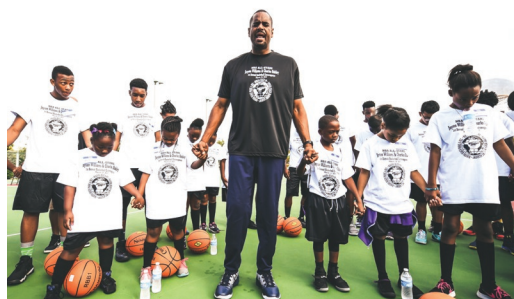
Jayson Williams praying with youth from the camp