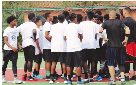
Jayson Williams talking with Camp teenagers

The Jayson Williams and Charles Oakley Basketball Camp was held on Saturday, March 18, 2017, at Dan Calloway-Tate Recreation Center. What a memorable day it was - not only for Riviera Beach youth and their parents, but for the entire City of Riviera Beach.