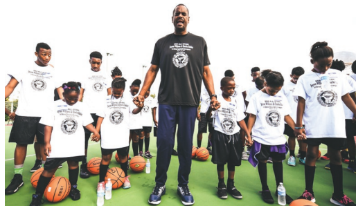
Jayson Williams praying with youth from the camp